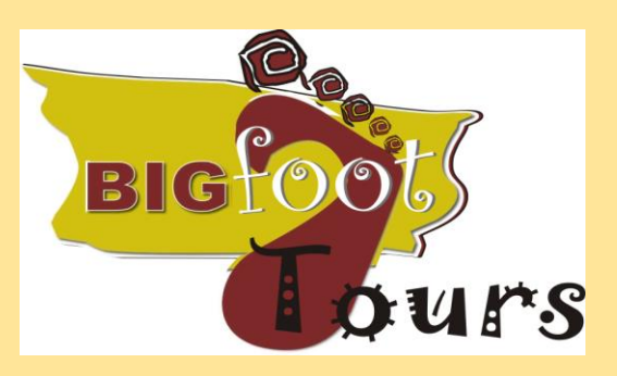
"Where the real African Adventure begins"