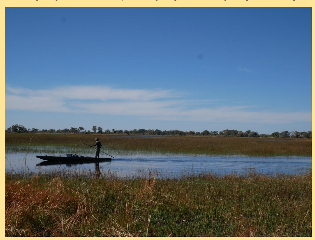
Boating by Bigfoot Tours

We have packages for 1,2, and 3 days and longer trips can be arranged as per client's request.